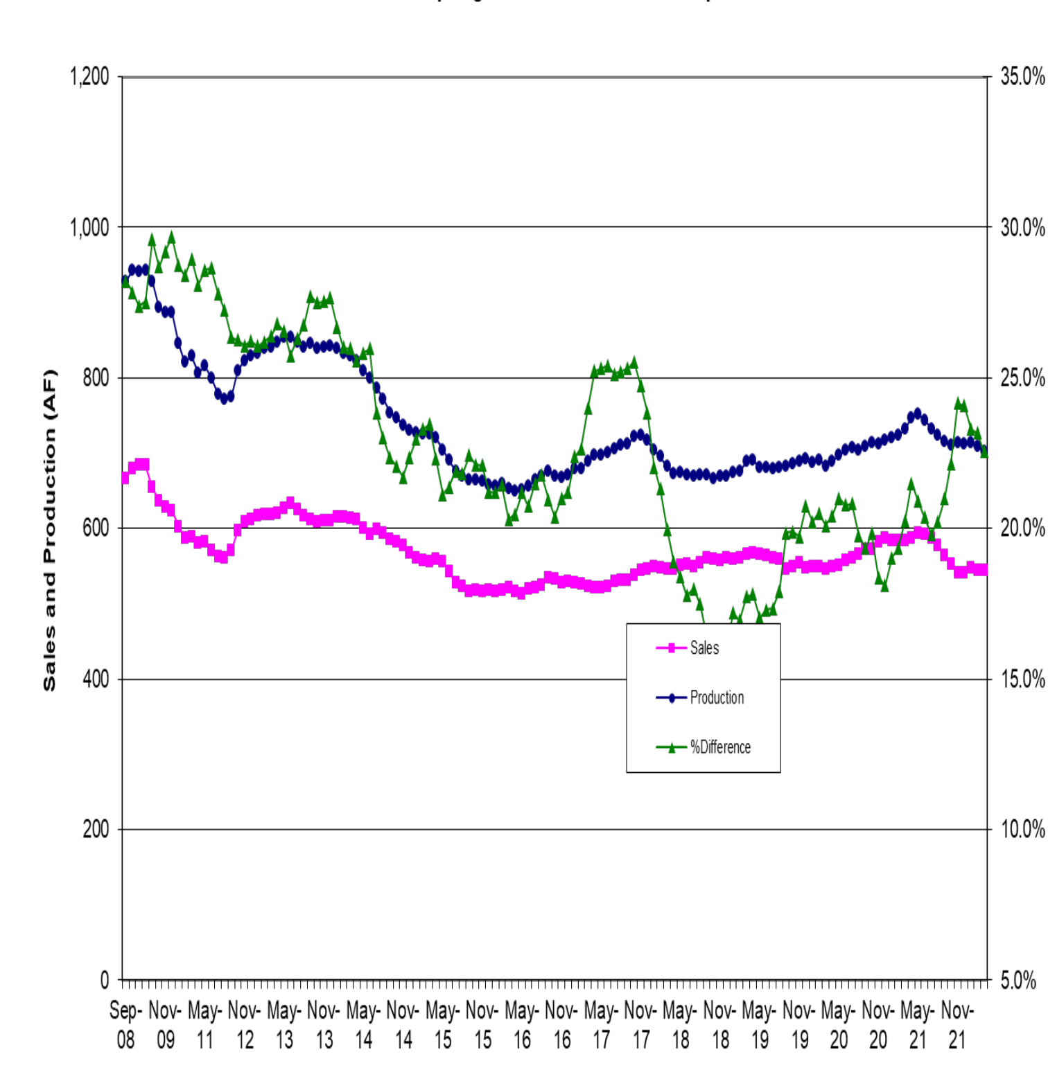
Figure 1. Water Production and Sales 12 Month Moving Averages Sweetwater Springs Water District Since September 2008